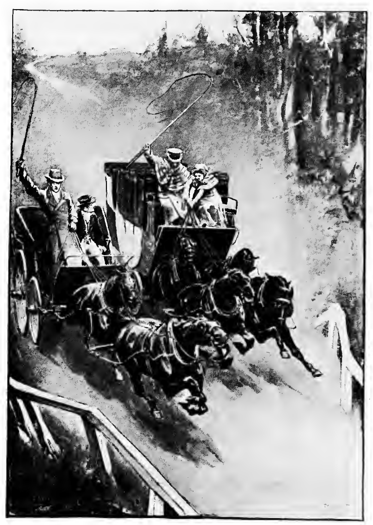
DOWN WE THUNDERED TOGETHER.